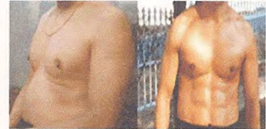
[SBS, MBC] 화제의 복근 만들기!