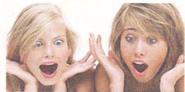
여자가 놀라는 남성 사이즈는?