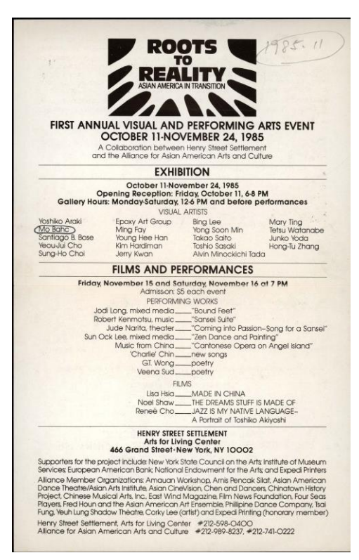
Fig. 1. Poster for Roots to Reality: Asian American in Transition , exhibition presented at the Alliance for Asian American Arts and Culture in collaboration with the Henry Street Settlement, New York, October 11–November 24, 1985.

reveals the relatively small proportion of active Korean artists and lack of awareness and experience of collective activities with different ethnic groups among recent Korean immigrants. Korea was one of the world's most ethnically homogeneous countries, and its national identity was constructed based on a belief in Korean ethnic nationalism. Therefore, Korean-born artists who immigrated to the United States or came to the United States for educational and career reasons would need opportunities to learn about the multiethnic and multiracial character of American society. However, following the mid-1980s influx of Korean-born artists and art students into the United States, and the simultaneous increase in the visibility of collective activities of Asian American artists and activists, Korean artists and cultural activists became associated with these Asian American arts organizations and participated in collective practices.