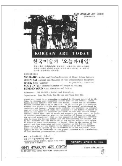
Figs. 2, 3. Left: Binari, "The Road To Foreign," 1986, in Roots to Reality II: Alternative Visions , exh. cat. (New York: Alliance for Asian American Arts and Culture, 1986), 29. Photo courtesy of Yong Soon Min. © Asian American Arts Alliance; right: Poster for "Korean Art Today," symposium presented at the Asian American Arts Centre, New York, April 24, 1988. Photo courtesy of Sung Ho Choi. © Sung Ho Choi