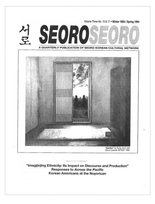
Fig. 8. SEORO Bulletin (SEORO SEORO) 3, no. 10/11 (Winter 1993/Spring 1994).