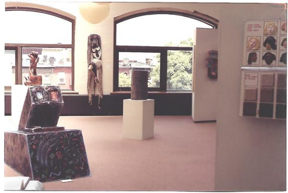
Figs. 5, 6. Left: Artists Against Racial Prejudice, postcard for The Mosaic of the City: Artists Against Racial Prejudice , exhibition presented by Artists Against Racial Prejudice and The Center for Art and Culture of Bedford Stuyvesant, Inc., July 1–28, 1990. Cardstock. MoMA PS1 Archives, I.A.1533.; right: A view of The Mosaic of the City: Artists Against Racial Prejudice , exhibition presented by Artists Against Racial Prejudice and The Center for Art and Culture of Bedford Stuyvesant, Inc., July 1–28, 1990.

Organized as a response to the Red Apple boycott, the exhibition received significant political attention. During his 1989 campaign and his inauguration speech in early 1990, David Dinkins—the city's first African American mayor—had described New York City as a "gorgeous mosaic" instead of a melting pot, indicating respect for cultural difference.<sup>35</sup> Only a few days after his inauguration, however, the Red Apple boycott began, and the Dinkins administration received criticism due to inaction and its inability to end the boycott, which lasted more than a year.<sup>36</sup> The Mosaic of the City provided the perfect chance for the Dinkins administration to promote racial harmony in a way that suited Dinkins's original political agenda. The exhibition was supported by funds from New York City and changed its title from Monochrome , with the sign of a red circle crossed by a red line, to The Mosaic of the City: Artists Against Racial Prejudice , following the messaging of Dinkins's campaign.<sup>37</sup>