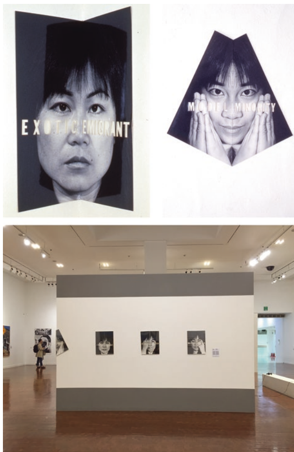
Fig. 2 Yong Soon Min, Make Me , 1989. Black-and-white photography, photo-collages.

Talking Herstory (1990) are distinguished accomplishments that clarify the integration of her photographic images and texts from this period (Fig. 2). 26 A close examination of these works is needed to understand her thought process and the gradual changes in her work over time.