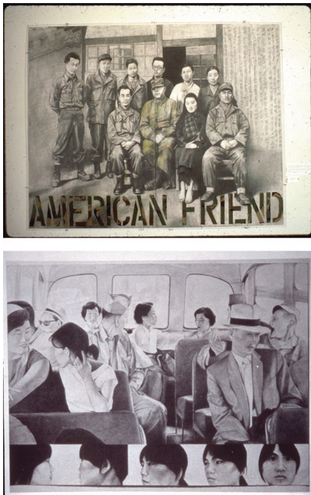
Fig. 1 (Top) Yong Soon Min, American Friend , 1984. Mixed media, drawing on paper, 39 × 55 in. (Courtesy of the artist). (Bottom) Yong Soon Min, Back of the Bus , 1985. Mixed media, drawing on paper, 29 × 40 in. (Courtesy of the artist)

there are two parts: “Back of the Bus” presents her mother sitting at the back of the bus, and 1953 is the year the artist was born. At the bottom of her drawing, the artist inserted several profile images of herself juxtaposing her adult presence with the past memories of her mother. This drawing